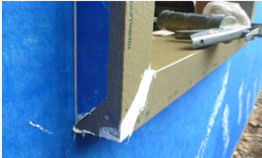
ThermalBuck features an integrated sill pan with a slope of 1/16" on all 8' lengths.

Download detailed installation instructions with photos at thermalbuildingsupply.com