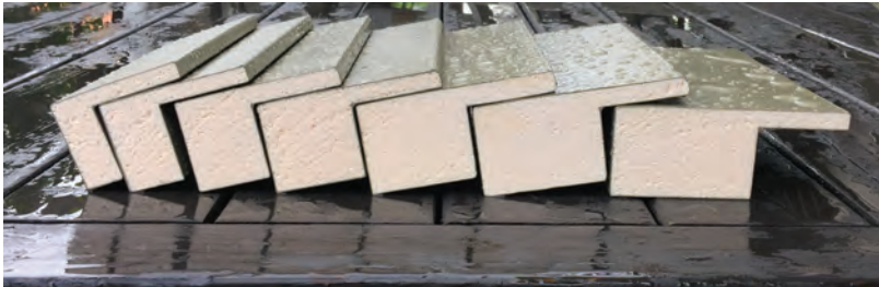
ThermalBuck High-Performance ROESE Rough Opening Extension Support Element

ThermalBuck both extends and insulates the mounting points of windows & doors to meet the continuous insulation and/or rainscreen plane. It limits thermal bridging in the building envelope, and creates a flush plane for cladding attachment.